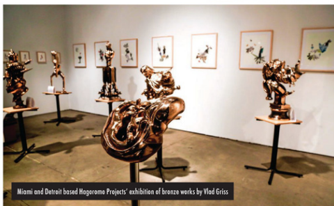
Miami and Detroit based Hageromo Projects' exhibition of bronze works by Vlad Griss