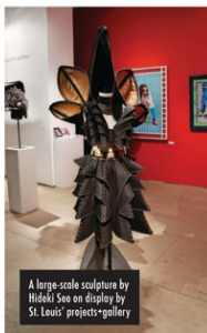
A large-scale sculpture by Hioki's see on display by St. Louis' projects+gallery

THE PERKS Following the lively conversation, guests wandered the fair, where exhibitions from around the world were on display. —JS